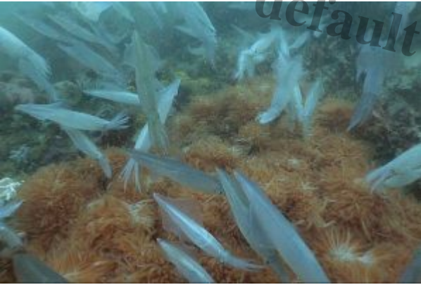
Film Shoots, Squid

Namibia is a land of contrasts and surprises. Where the once mighty Fish River carved its magnificent canyon, severe droughtsâ?!