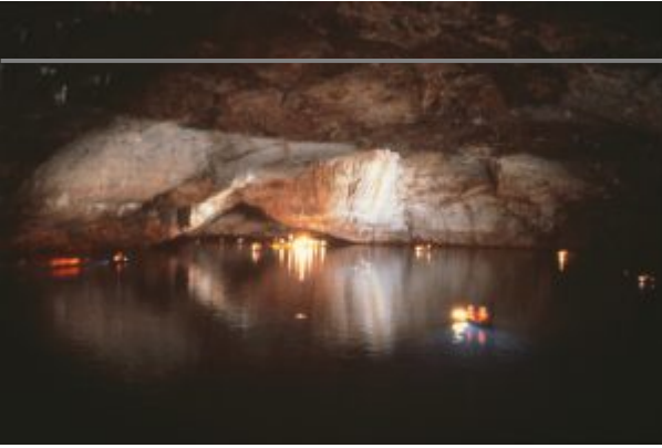
Cave Diving, Film Shoots