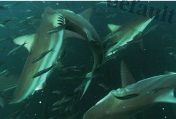
Articles, Film Shoots, Sardine Run

Location: Cape Point, South Africa Renowned underwater photographer Charles Maxwell has been involved in diving adventures for over 40 years!