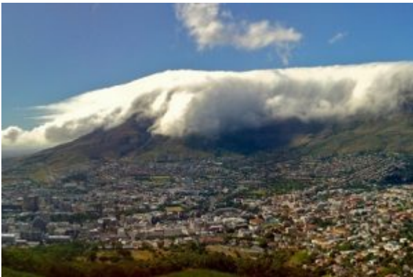
Table Mountain, Western Cape

In 1973 the Atlantic Underwater Club, of which I was a member, was approached by the South African Speleological Societyâ?!