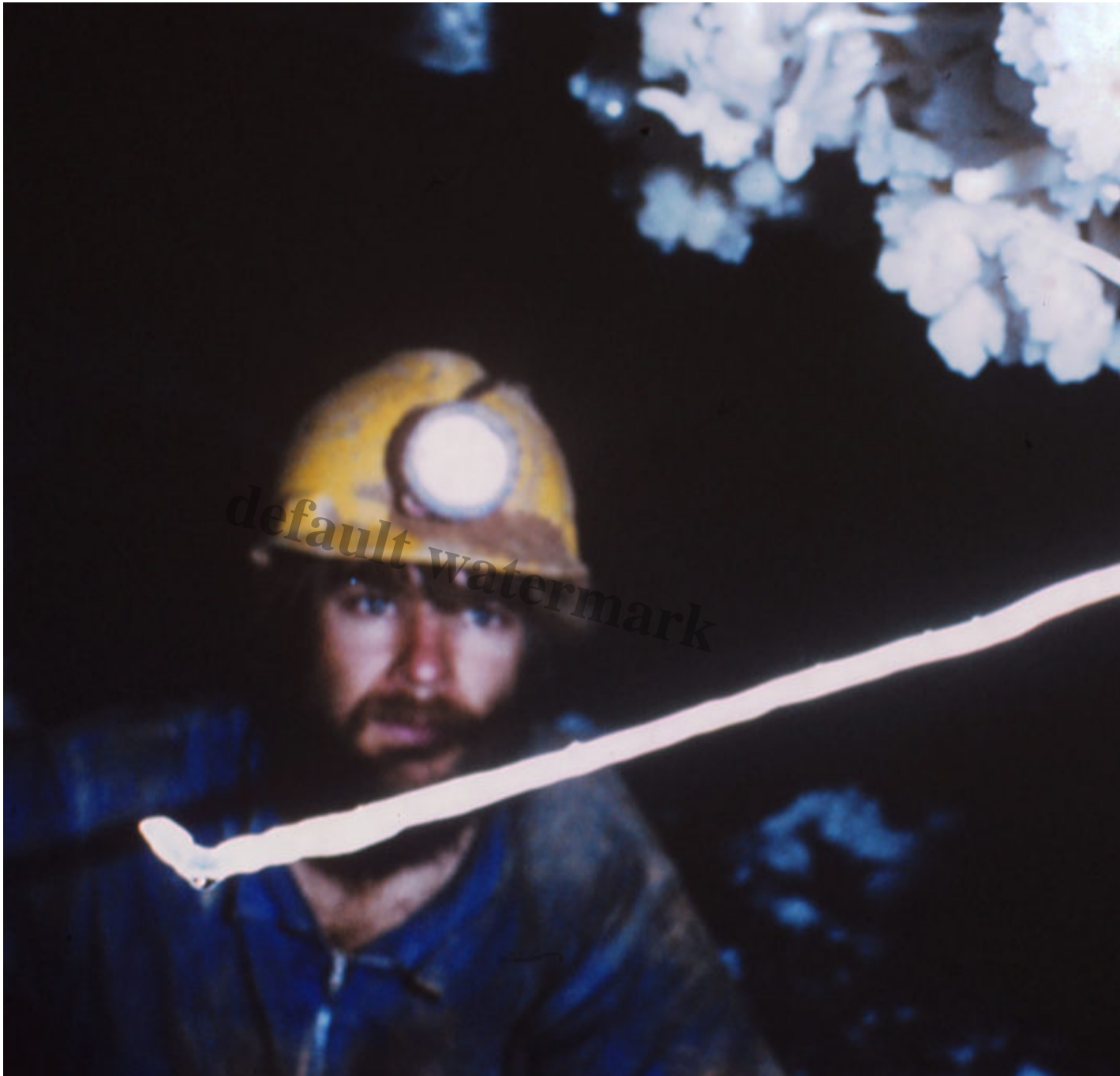
Long Delicate Calcite Formations