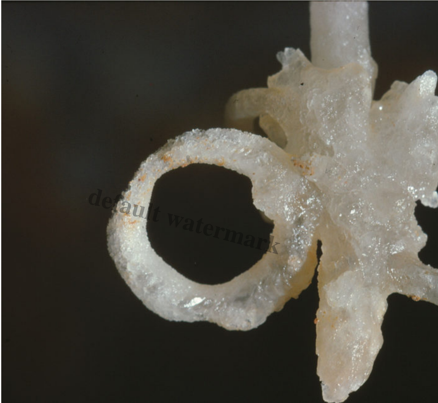
The Cango OK Stalactite