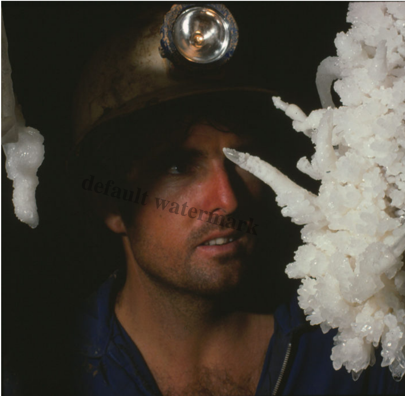
Cango 3 pure white formation