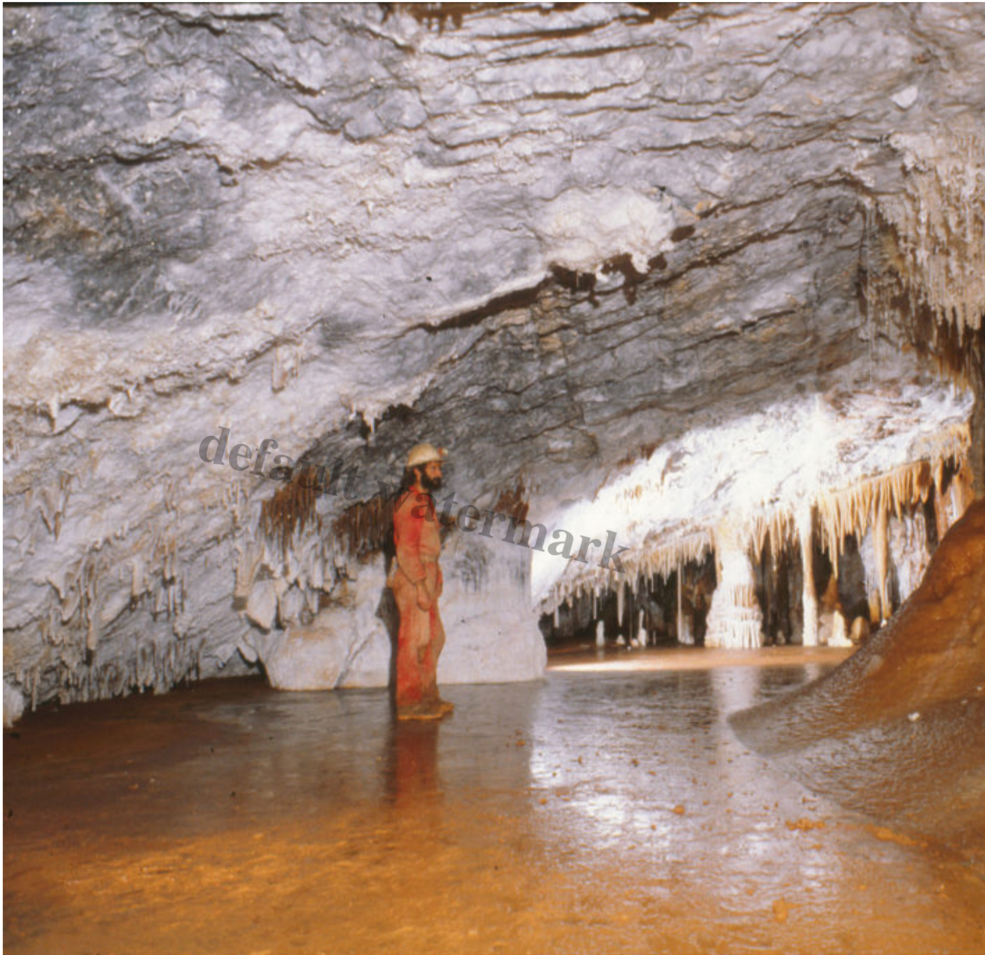
Perfectly Flat Calcite Floor