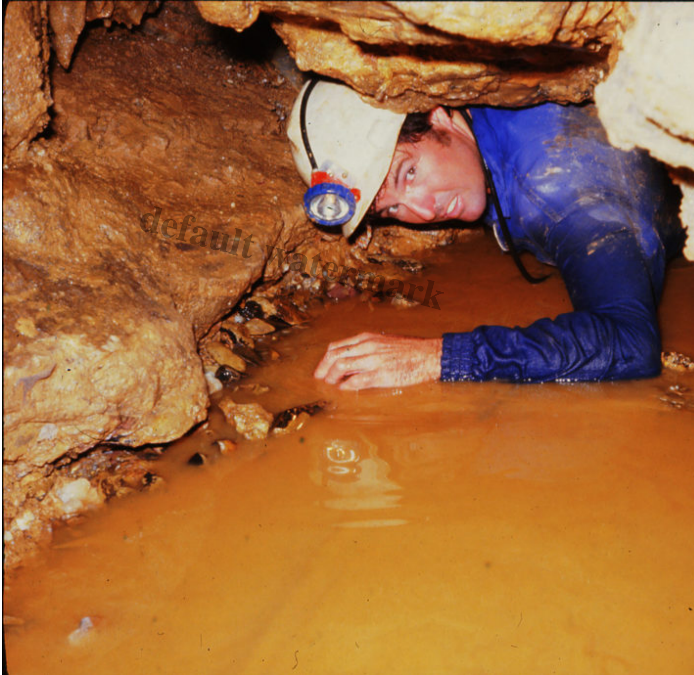
The Cango Sump

space and then the passage dipped below the water surface once more. While I was an experienced diver, this was totally new to me and I found these tight passages, in total blackness, claustrophobic and intimidating. I moved into the next passage. Fortunately the water was flowing towards me, thus keeping the visibility good.