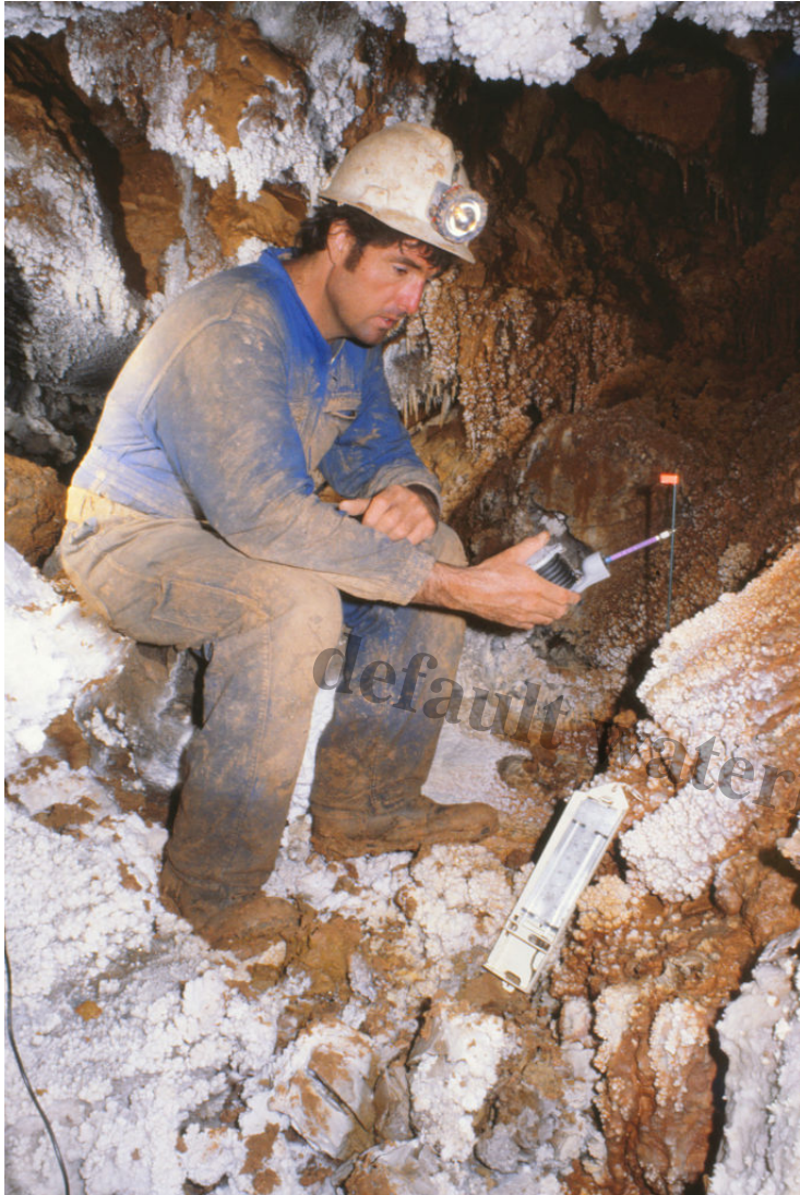
Testing Air Quality

Once the survey team and all our equipment and food was through the stream passage, the pump would be switched off, allowing the sump to flood and thereby sealing it off from the tourist cave to maintain the natural environment. At that point we were isolated from the outside world. Besides the task of completing the survey we had plenty of spare time to explore the cave and take photographs. Even the best written words and well taken photographs cannot begin to describe the feeling of awe and privilege of being part of the first cavers to explore this natural wonderland. In this world of perpetual darkness, other than for our torches, and no change in temperature or weather, we lost all concept of time and routine. The total, almost oppressive, silence was like nothing I had ever experienced before. It was like being alone in a Gothic cathedral. To quote from Jules Verne's "Journey to the Centre of the Earth", we had reached "A world within a world". Due to the relatively high concentration of carbon dioxide in the air, a common feature in a sealed cave environment, we found that our breathing rate and heart rate increased and our physical output was affected.