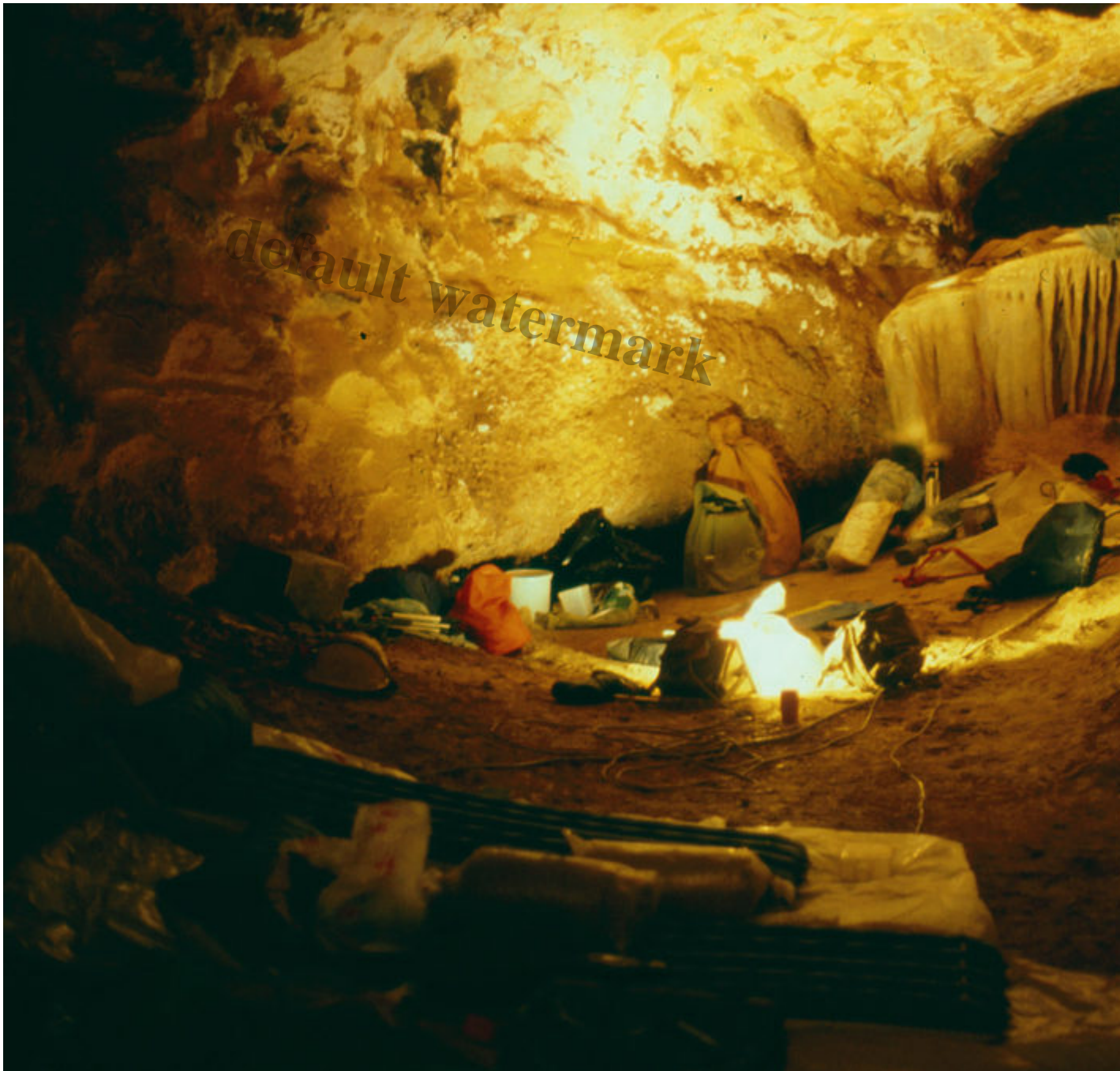
Where the team slept

What an unforgettable experience. I will never take such privileges for granted.