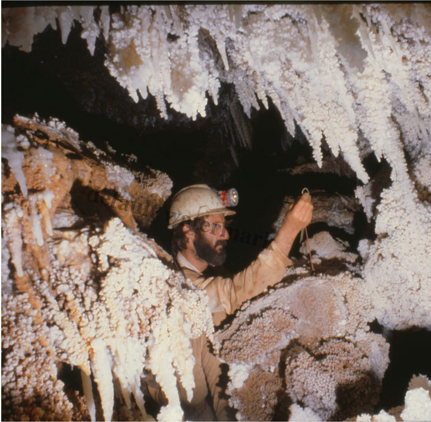
Cango 3 survey