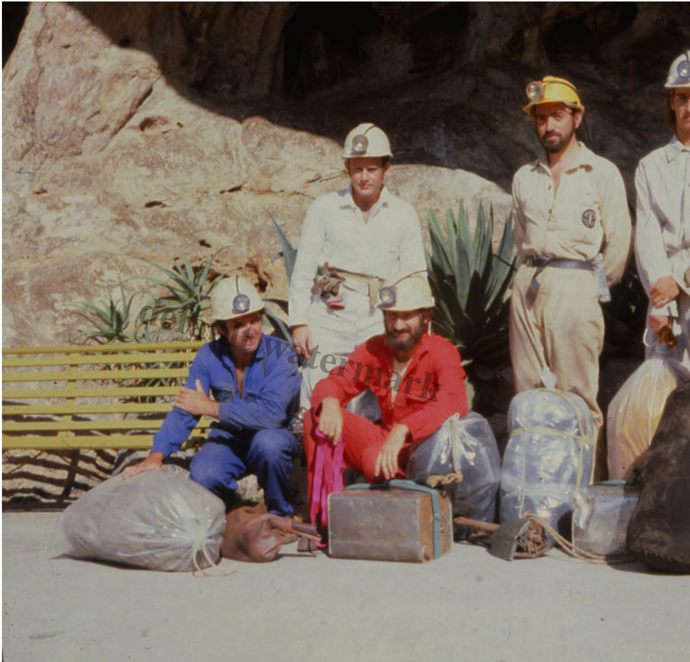
The exploration team

So, in early June, I arrived at the sump with a small team of divers and cavers. We had travelled through the well-trodden tourist section and the beautiful, newly discovered section called Cango 2 that had access restricted to a handful of cavers. The sump was situated on a lower level of the main cave. It was a small and unimpressive pool of water flowing from beneath a rock wall and on down a stream passage, into the blackness.