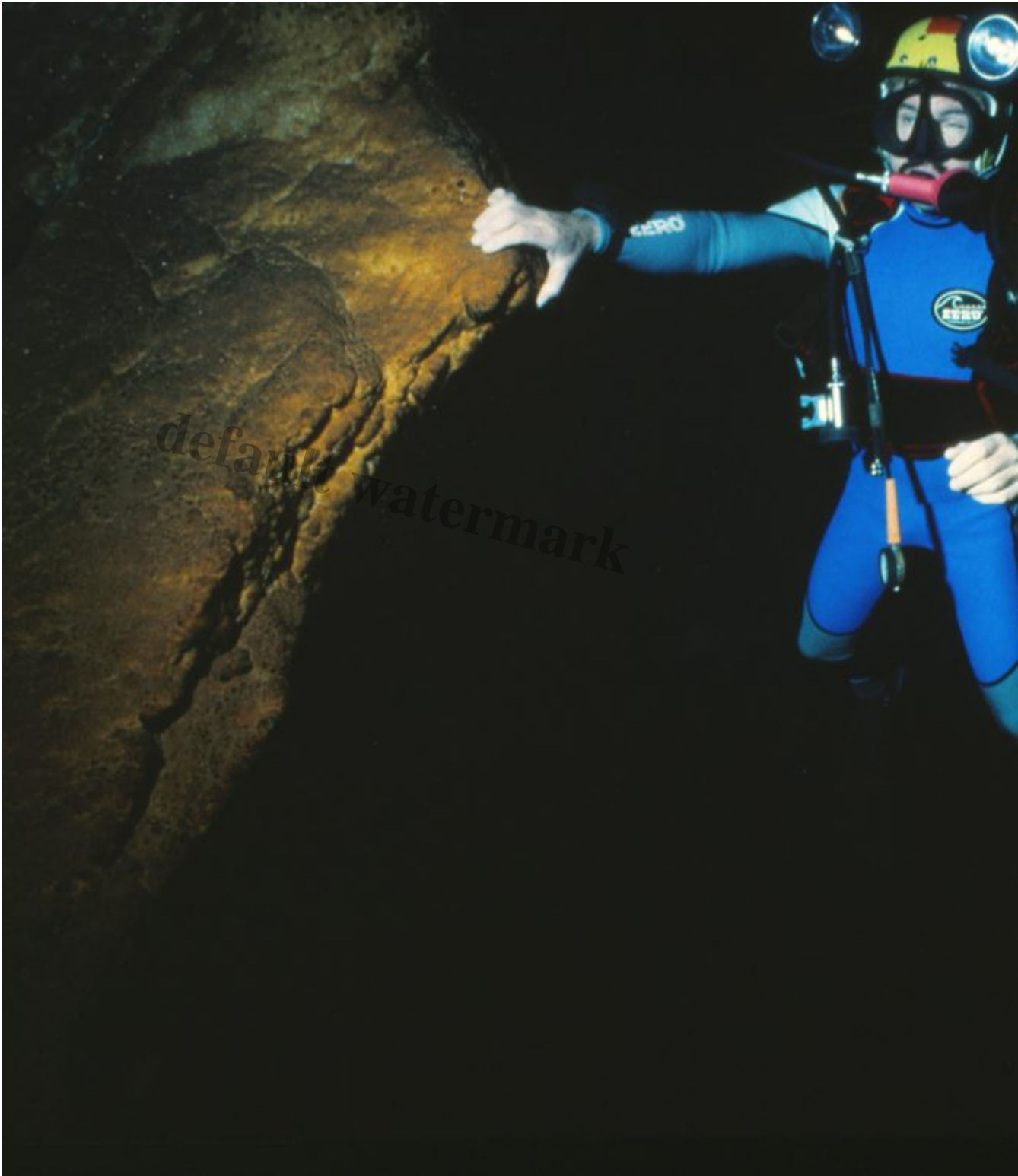
Diver in Dragonsbreath