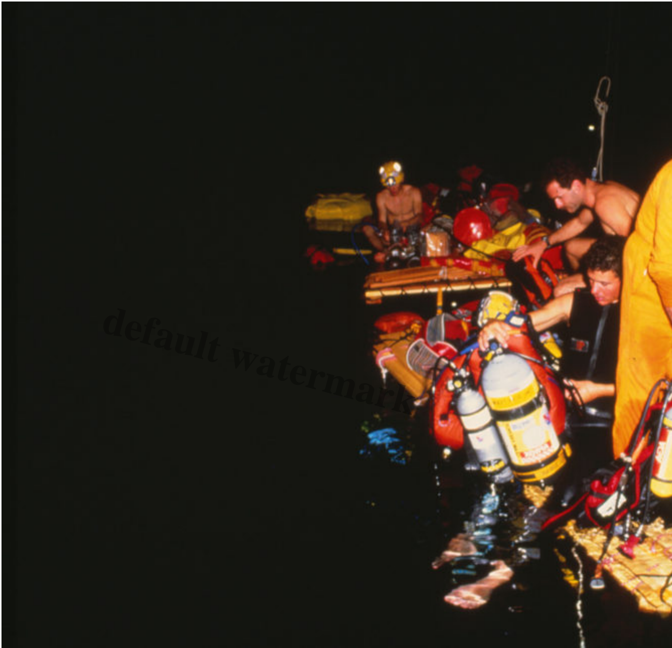
Diving Raft in Dragonsbreath.