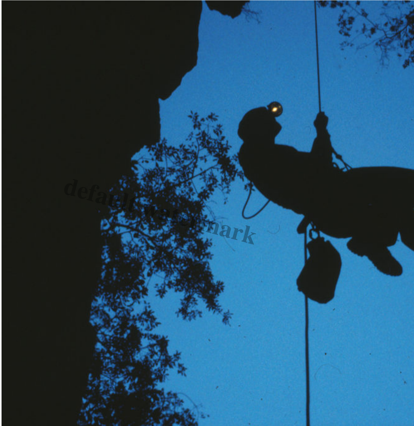
Abseiling into Cave