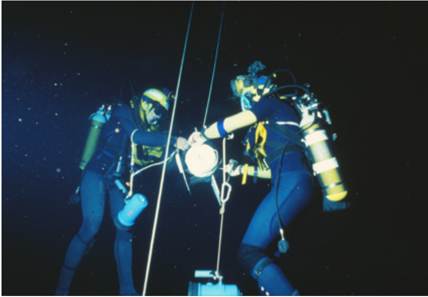
Dragonsbreath Divers with Safety Line