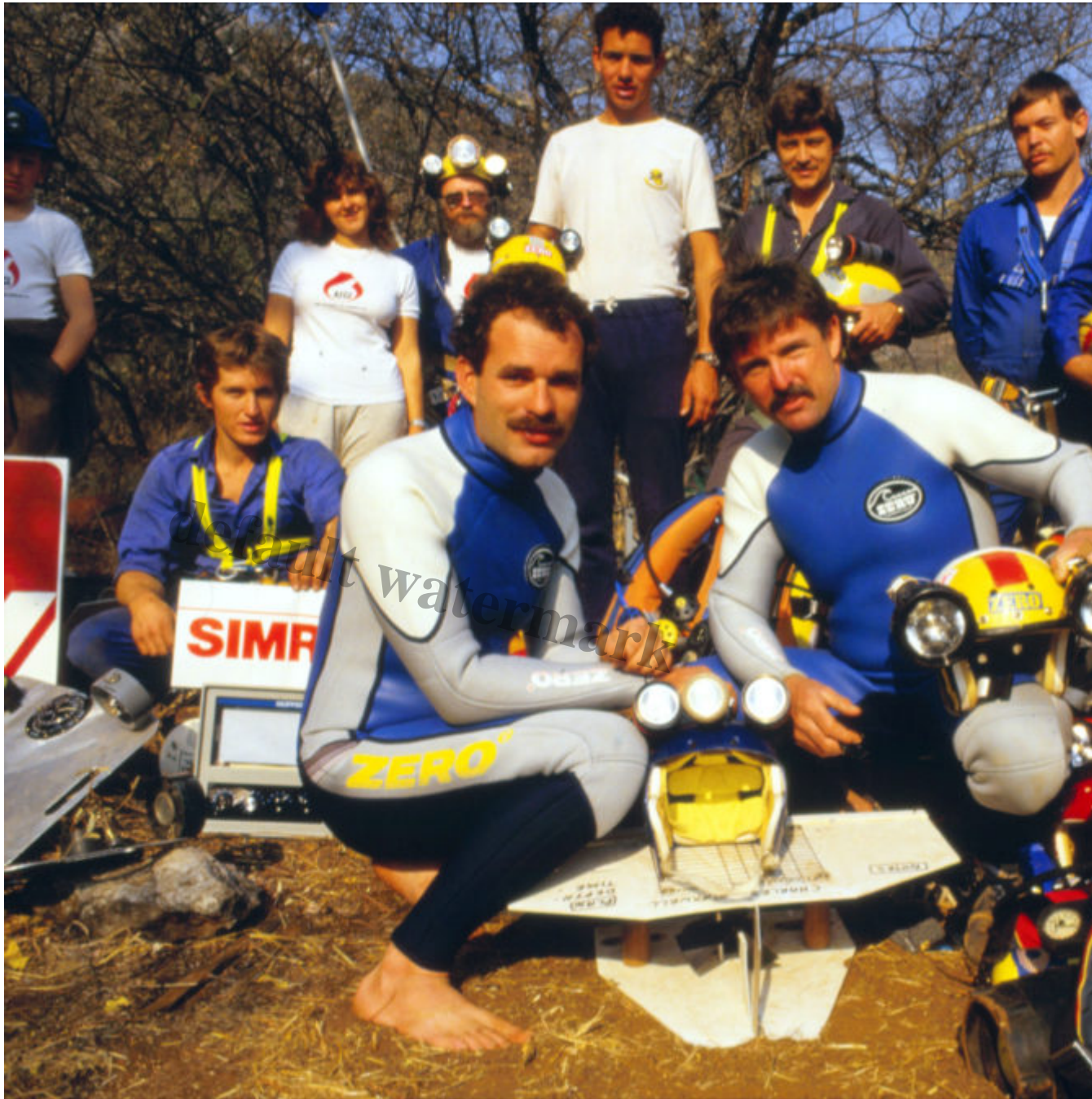
Dragonsbreath Diving Team