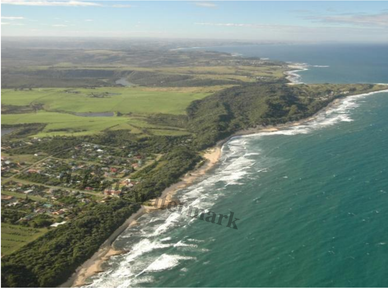
Port St Johns Looking North