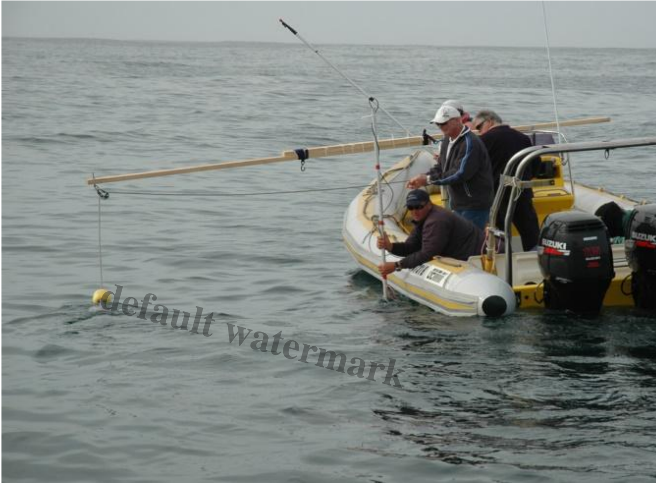
Using Our RIB to Track a White Shark