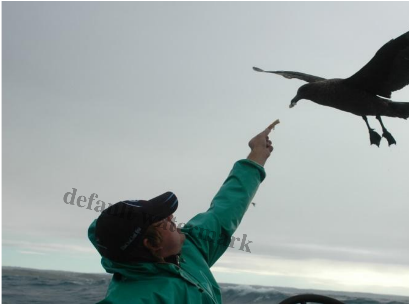
Taking a Break from Chasing Sardines to Feed a Petrel