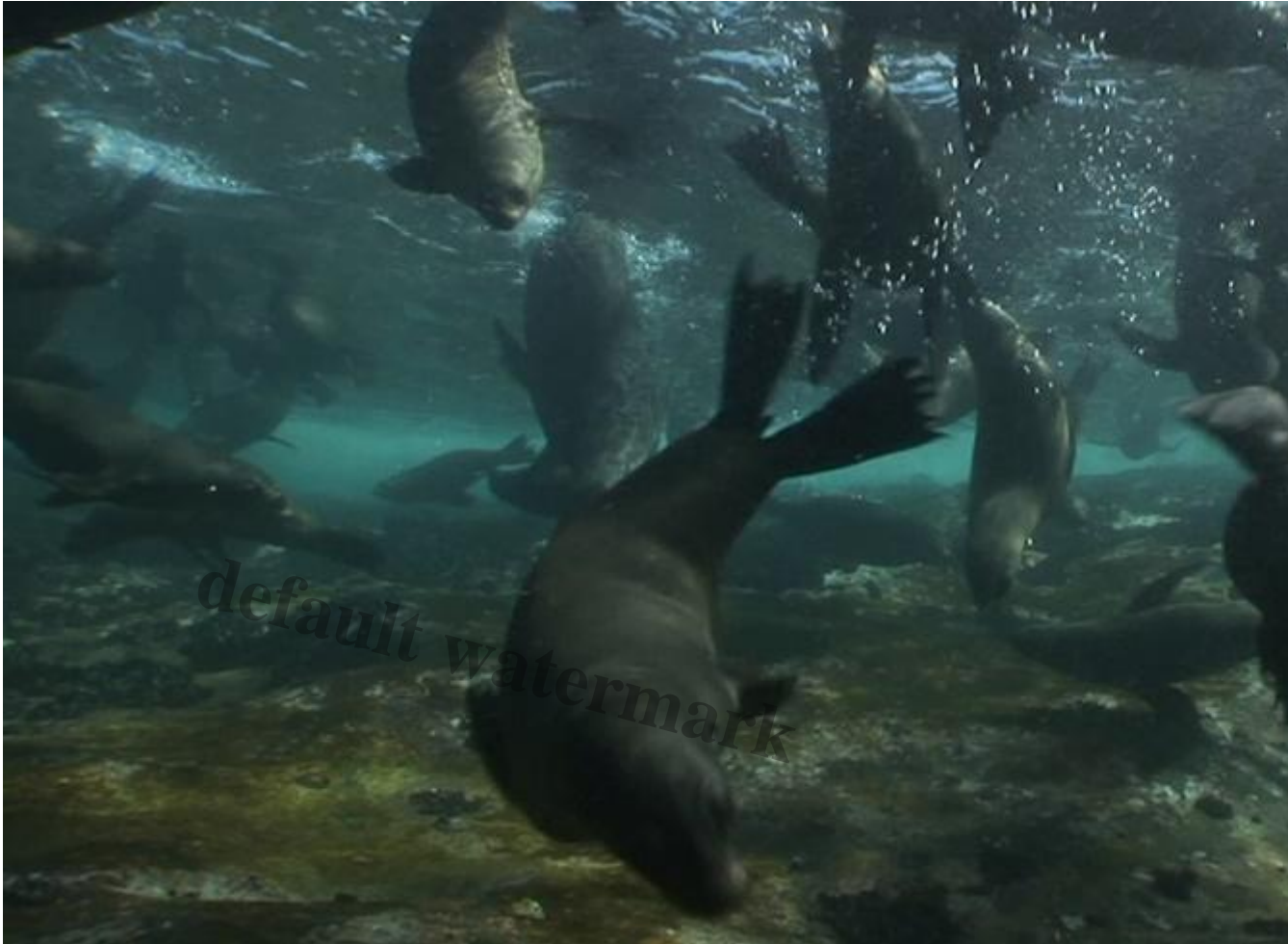
Rafting Seals near Seal Island, False Bay