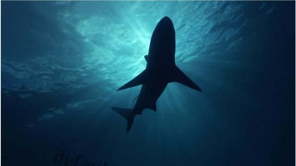
A Blacktip Shark Cruises by Overhead